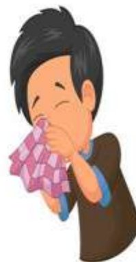
Coughing and Sneezing Hygiene